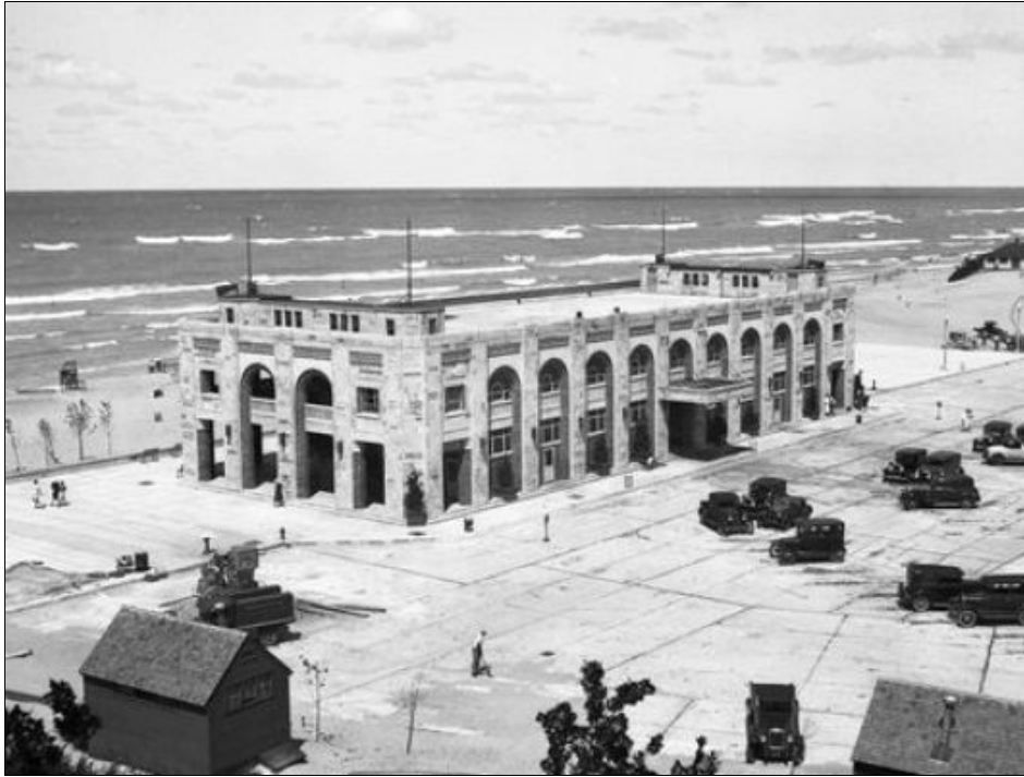
The Pavilion at Indiana Dunes State Park, circa 1931 Note West Plaza (an element of the cultural landscape) to the left, already partially destroyed. This was not addressed by the Indiana DNR.