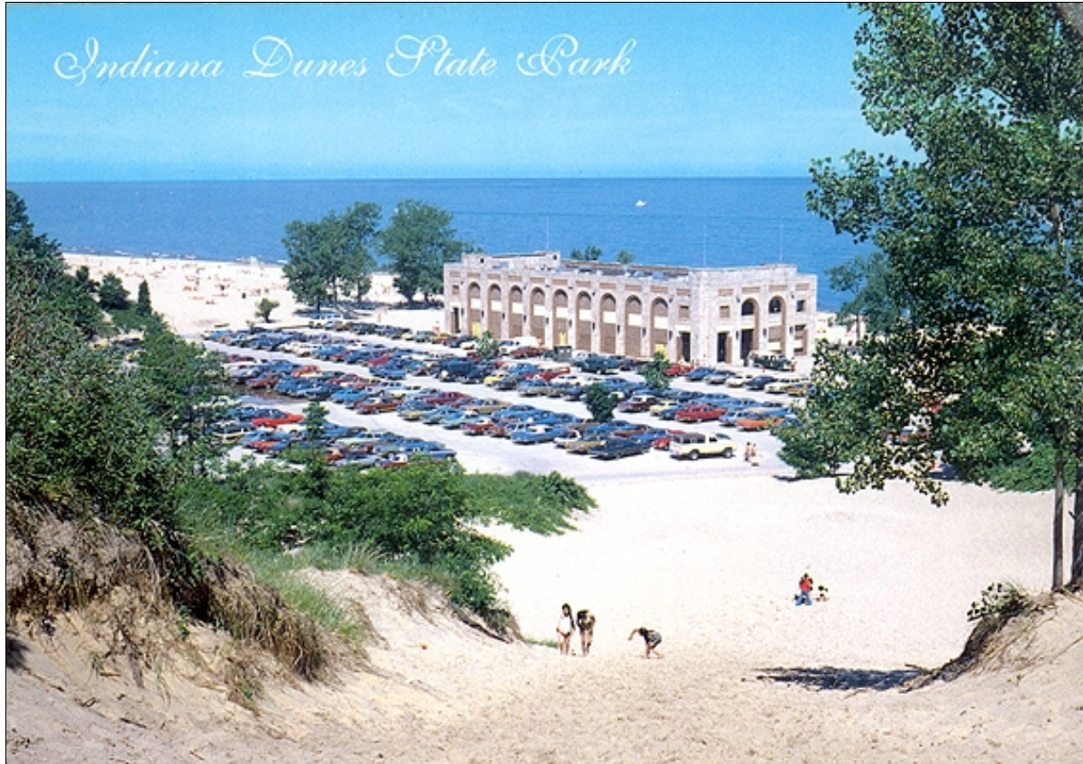
Pavilion at Indiana Dunes State Park, circa 1950s.