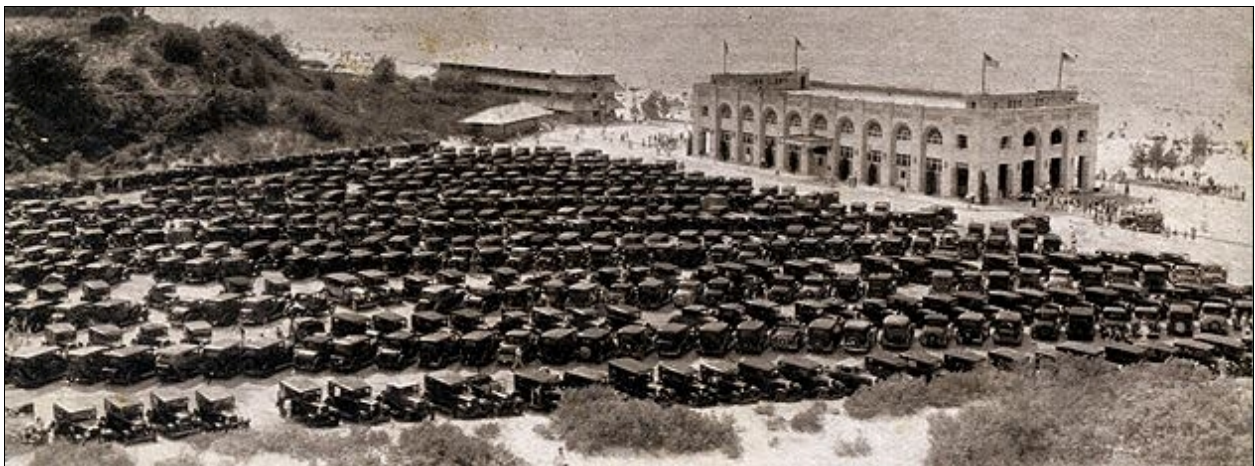
The Pavilion at Indiana Dunes State Park. (Hotel at top-center no longer exists.) Note East Plaza (an element of the cultural landscape) to the right. It would be destroyed by a proposed banquet center addition. This has not been addressed by the Indiana DNR.