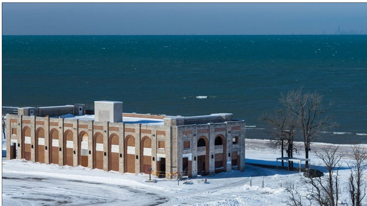
Top of elevator shaft, constructed in 2015 by the project developer without review or authorization by the Indiana DNR or the National Park Service. The elevator was intended to serve an 1,800 square foot rooftop bar/pub.